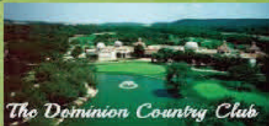
The Dominion Country Club